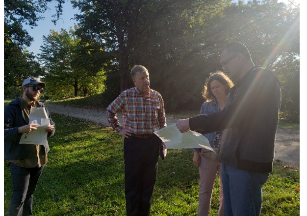
A survey stake in the foreground; looking out over the possible BMP location