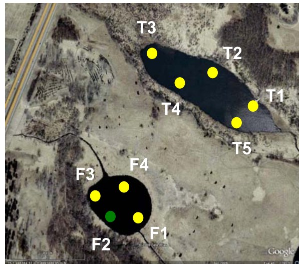
Figure 3. Sediment sample locations are shown with a circle. The circle color indicates the potential for nuisance curlyleaf pondweed to occur at that site. Key: green = low; yellow = medium; red = high potential.