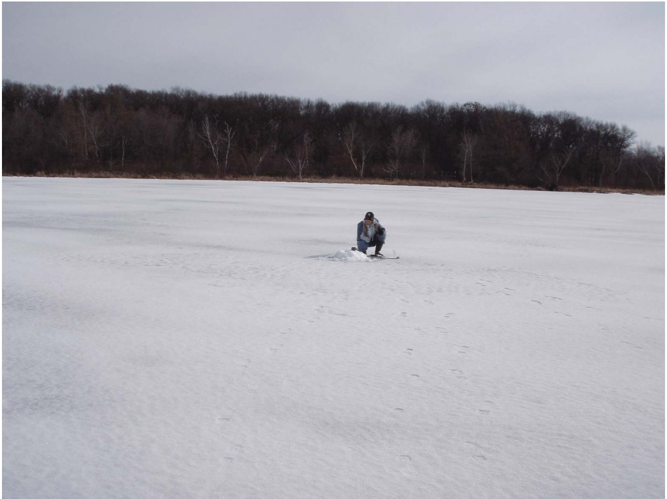
Tamarack Lake, March 2008