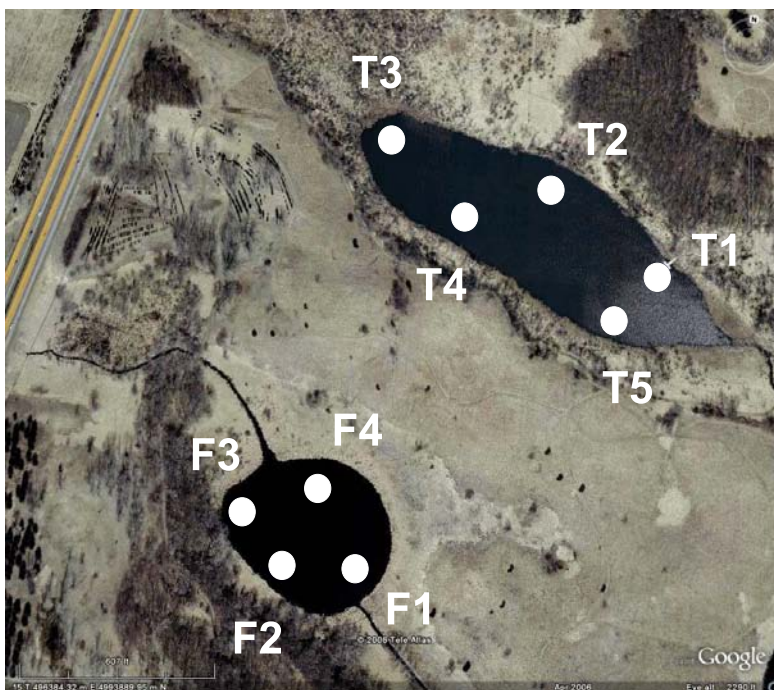
Figure 2. Lake sediment sample locations are shown with white dots.