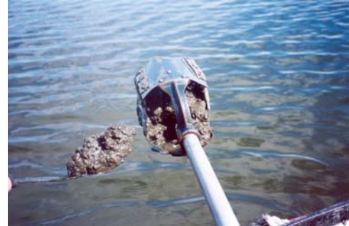
Figure 1. Soil auger used to collect lake sediments.

Reporting Lake Soil Analysis Results: Lake soils and terrestrial soils are similar from the standpoint that both provide a medium for rooting and supply nutrients to the plant.