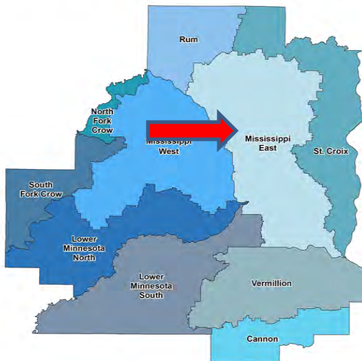
Twin Cities Metro Area Allocation Map for the Watershed-based Implementation Funding Program