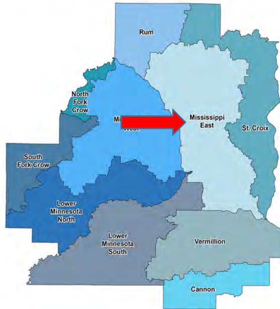
Twin Cities Metro Area Allocation Map for the Watershed-based Implementation Funding Program

VLAWMO staff have been actively involved in discussion with the other watersheds/WMOs SWCD's, Counties and Cities located in the Mississippi East watershed (See map) for the purpose of distributing the Board of Water and Soil Resources (BWSR) Watershed-based Implementation Funding. After much discussions, the Mississippi East watersheds/WMO's are recommending to BWSR that the funding be allocated equally among the seven watersheds /WMO's which would mean apx. $93,000 for implementation of activities in the their State approved watershed management plans. If this recommendation is ultimately approved by BWSR, VLAWMO Staff would anticipate that this grant funding would be targeted to implement activities identified in the Wilkinson Lake Feasibility study or for implementation practices within the within the Goose Lake subwatershed. Timing to spend the grant funding would be 2021- 2023. Staff hopes to provide the TEC with an update on the BWSR approved grant allocation to VLAWMO later in the year.