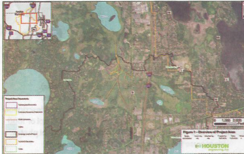
The figure shows the project area to the south of Wilkinson Lake.